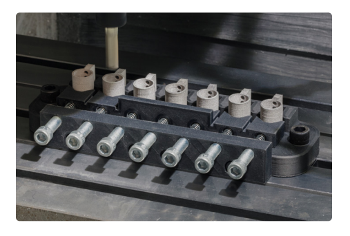
01 Manufacturing jigs & fixtures

Designed for versatility, the printer supports a wide range of both filament and fiber composites to enable a broad set of applications from consumer goods to automotive.